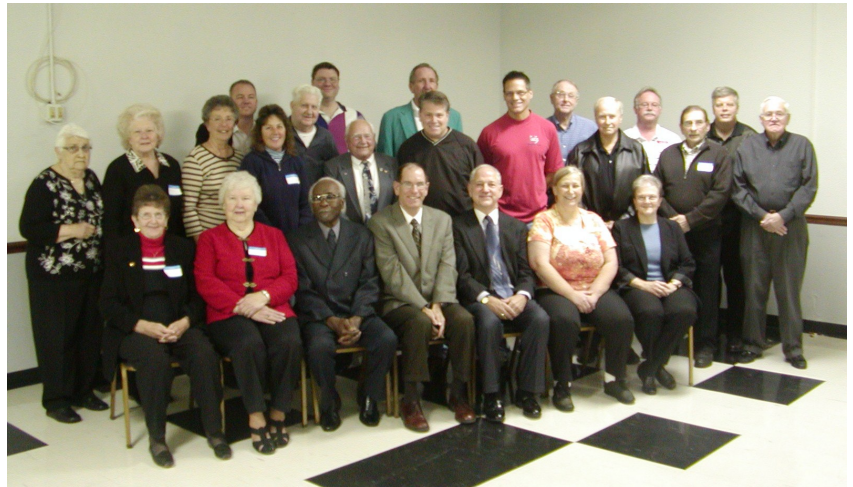
Gr. Toledo USBC Association Hall of Famers attending 2010 Hall of Fame Reception